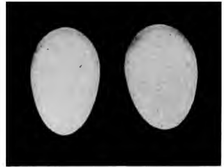
第五十一圖 アマツバメの卵 (約實物大少しく縮少)